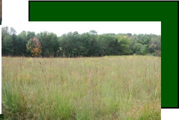
Native Grass Planting