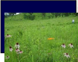
Wildlife Habitat Planting